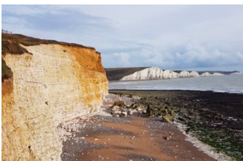
Seaford Head

Going forward, annual work planning for the Nature Partnership will focus on the strategy and prioritise elements within it to inform future work.