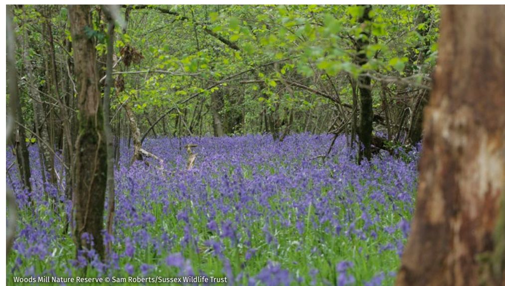
Woods Mill Nature Reserve

It therefore remains unchanged with a review to be deferred until 2022.